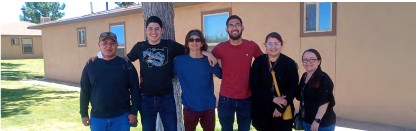
Hearing impaired youth from the El Paso Youth-Build program, learning work skills, as paid interns on an ICAST project.